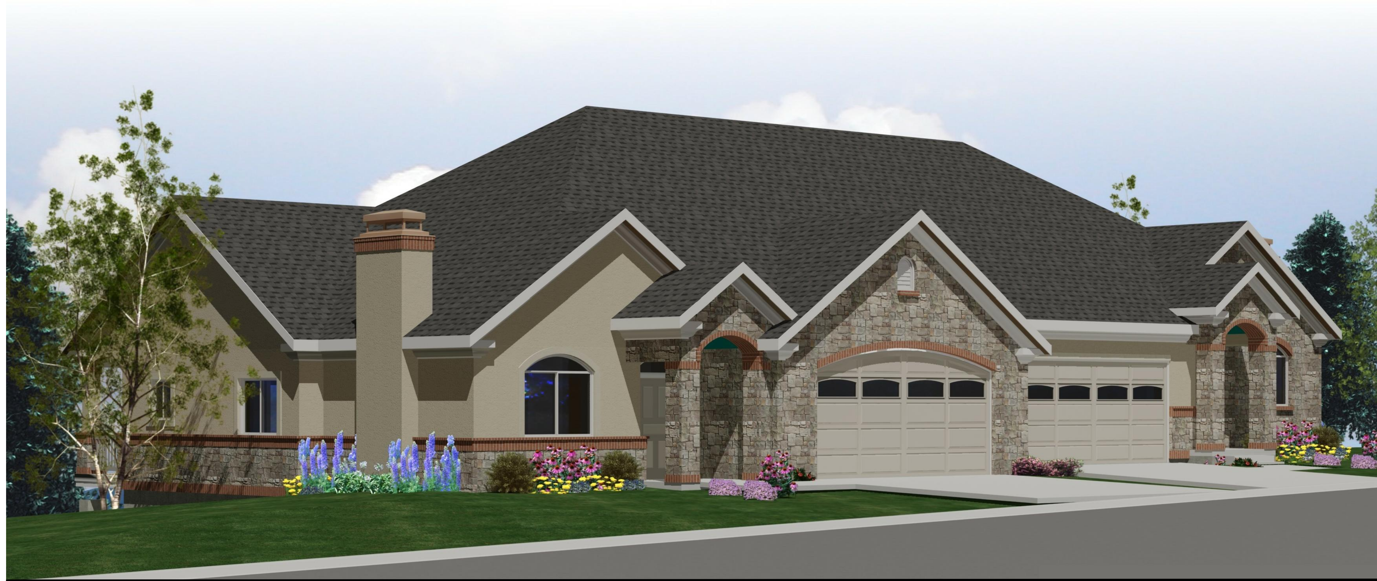
Plan II - Unit C & D - Lot 27 & 28